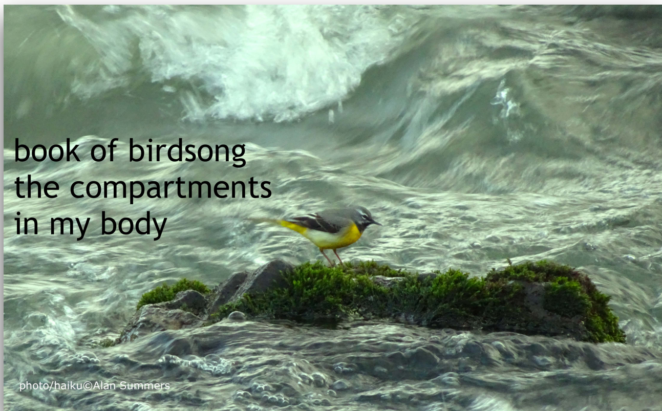
Grey Wagtail March 2022